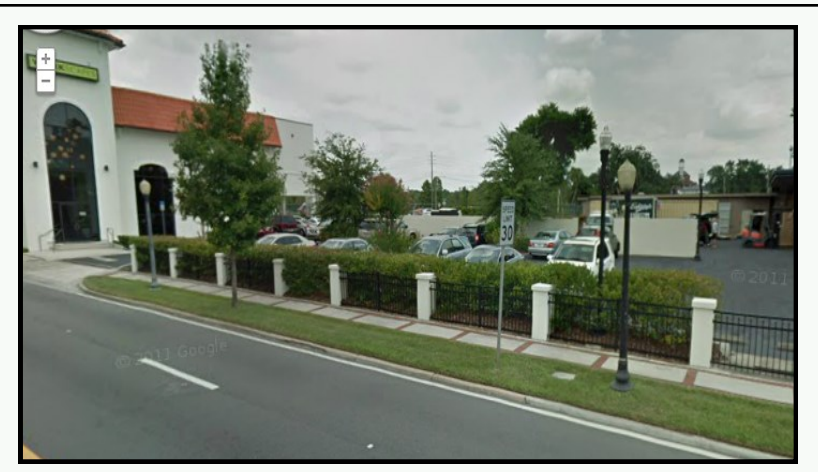
BANC Program supports landscape screening at parking lot

Perhaps individual \mathbf{no} property improvement delivers more positive returns than landscaping and irrigation approved through the BANC Program. In addition to energy savings from overhead shade and beautifying generally your property, properly chosen and located plant materials can effectively screen unsightly elements and parking areas, and guide customers to your business. Up to $1,200 of BANC Program funds may be used toward waterand low-maintenance Florida saving Friendly landscaping projects.