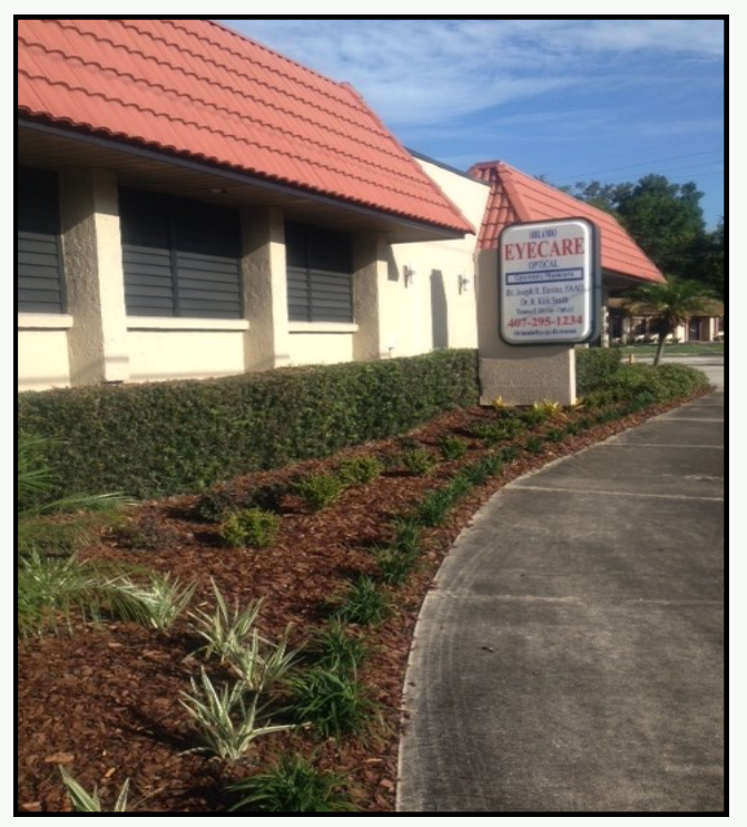
This owner installed foundation landscaping and monument signage supported by the BANC Program