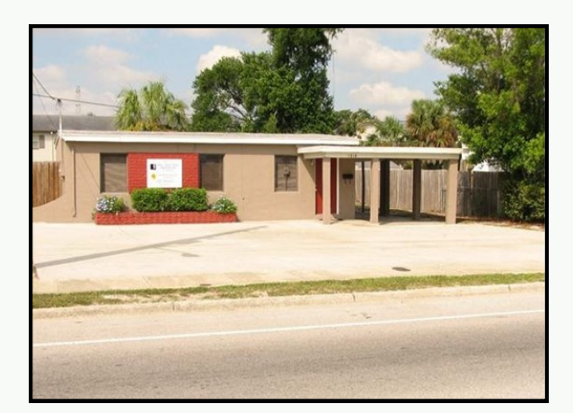
Before façade improvement

Small businesses serve as engines for local and County-wide growth by providing employment opportunities, serving as anchors for the community, while also generating tax revenues. Bringing back the small businesses that once thrived on your business corridor, while stabilizing and expanding the existing businesses, is at the heart of the BANC Program. The BANC Program provides funding assistance for costs related to opening or improving small businesses corridors located within targeted of unincorporated Orange County.