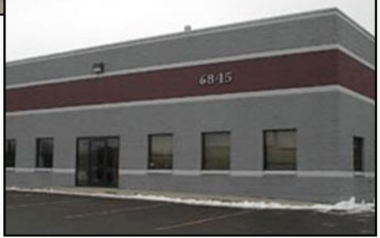
The BANC Program supports earth tones and muted paint color patterns like this building.