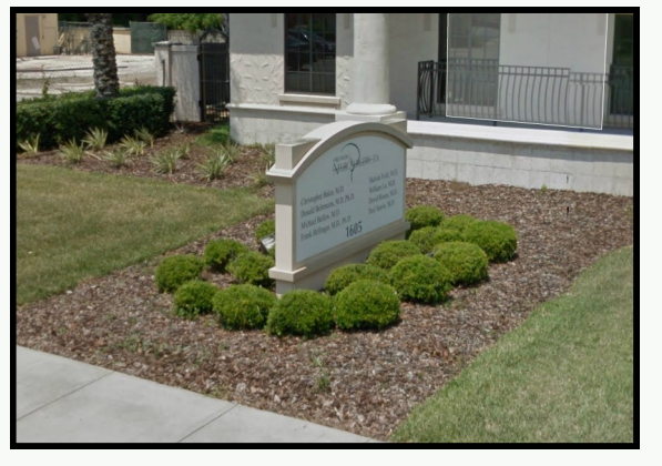
BANC Program supported monument sign

In order to support small business advertising, while also avoiding visual sign clutter, the BANC Program supports business signs which meet the guidelines of Code Chapter 31.5, and which complement and enhance your corridor's visual character. Be sure to identify and discuss your existing signs with the a Business Assistance Team member.