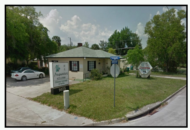
BANC Program supported monument sign