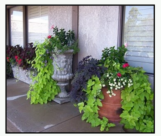
This owner installed containerized plantings along the front of the store.

Trees planted within parking lots provide shade and separate the public street and sidewalk from your property.