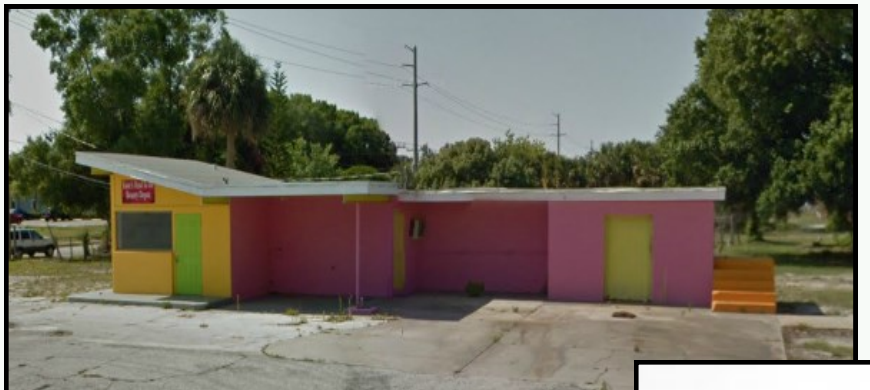
Bright or fluorescent paint colors, like those shown to the left, are prohibited by the Orange County Code and cannot be paid for by the BANC Program