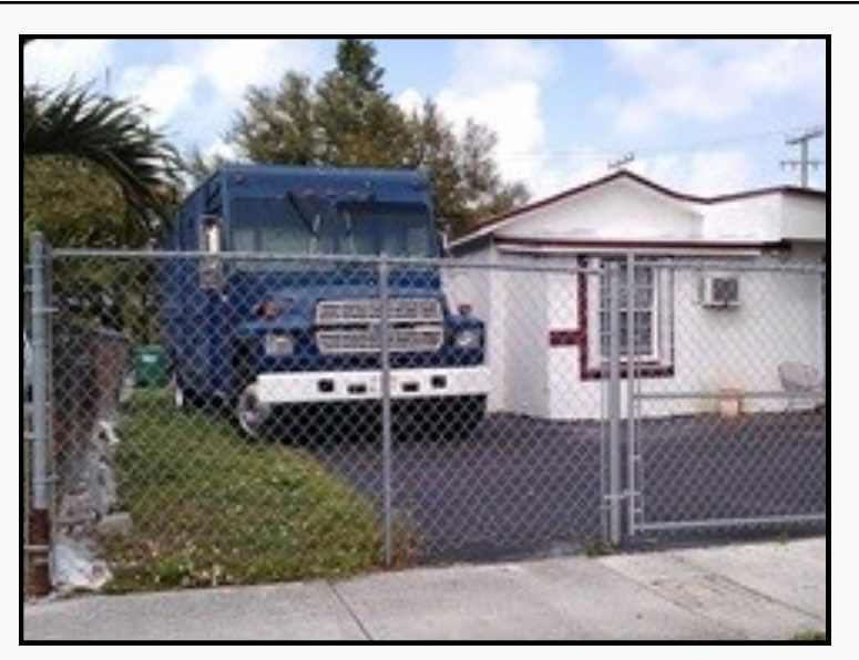
An example of a chain link barbed wire fence that can not be funded through the BANC Program.

The BANC Program cannot be used to install chain link or barbed wire style fencing. However, consideration will be given for properties within certain industrial settings.