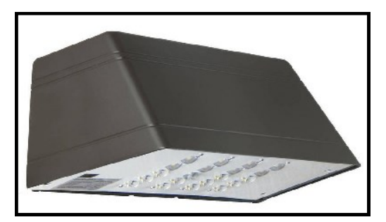
BANC supports wall mounted flat lens

Guided by the County's exterior lighting ordinance, the BANC Program supports carefully chosen safety and appearance lighting solutions. Acceptable light fixtures are generally described as full cut-off, flat lens. Cut-off fixtures feature flat lower glass components which prohibit annoying light from 'spilling' sideways onto adjacent properties, or upward. A Business Assistance Team member will help applicants to choose the appropriate wall and pole mounted light fixtures.