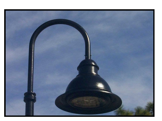
BANC Program supports flat lens pole fixtures